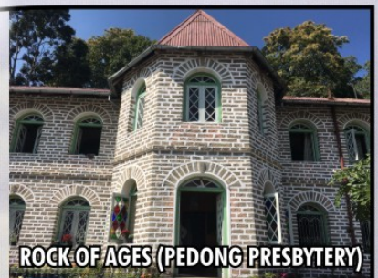
ROCK OF AGES (PEDONG PRESBYTERY)